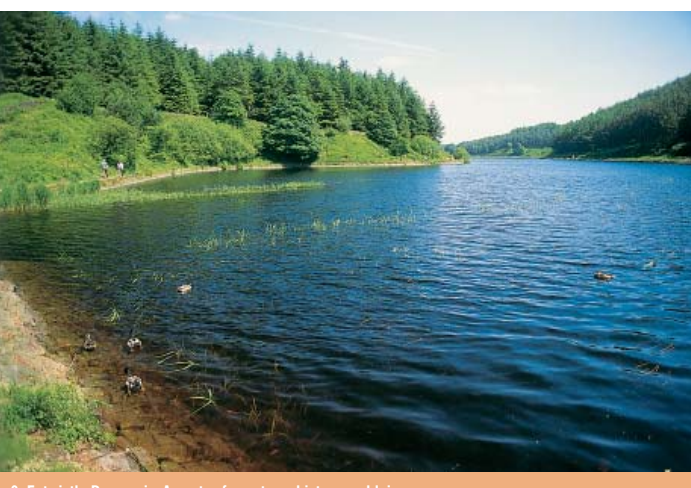
. Entwistle Reservoir: A centre for nature, history and leisure

Strawbury Duck, Entwistle (01204) 852013